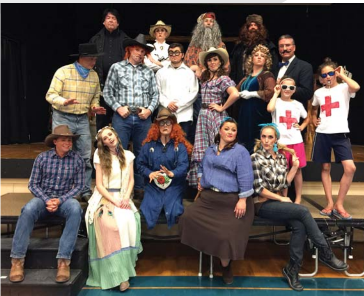
Annual Rockland Melodrama