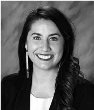
DEPUTY DIRECTOR & GOVERNMENT AFFAIRS